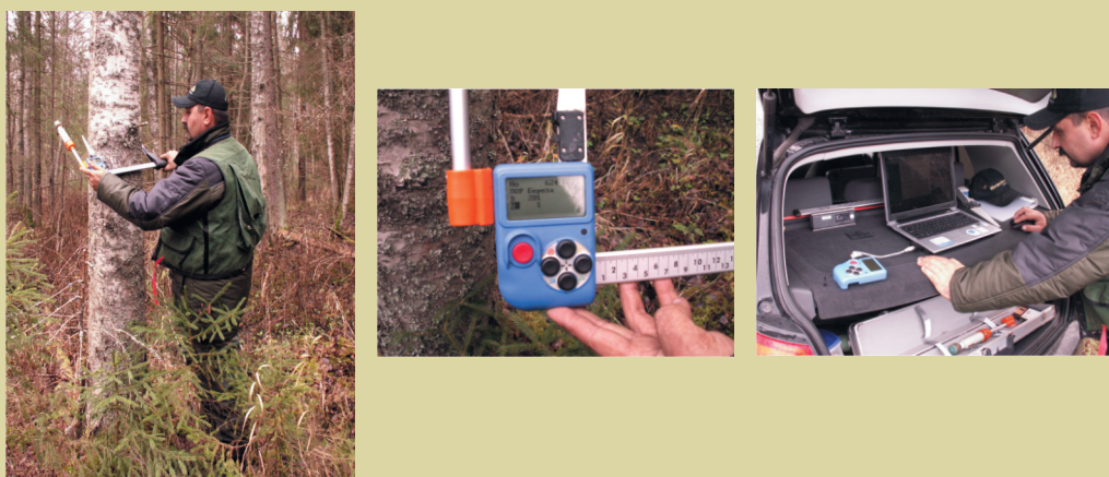
Figure 4. Measurement and recording by data calliper and field computer

Developed inventory work in a logging tract, connected to a digital chain of data, is shown in Figure 4.